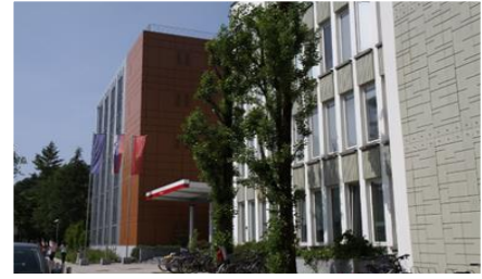
Faculty of Health Sciences