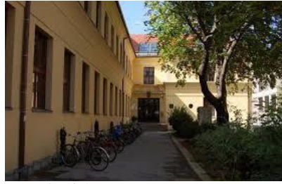
Faculty of Pharmacy