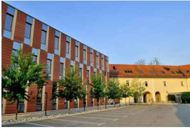
Faculty of Medicine